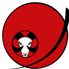
Daitoryu Aiki Jujutsu Bokuyokan