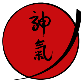
Aikido Shinki Rengo